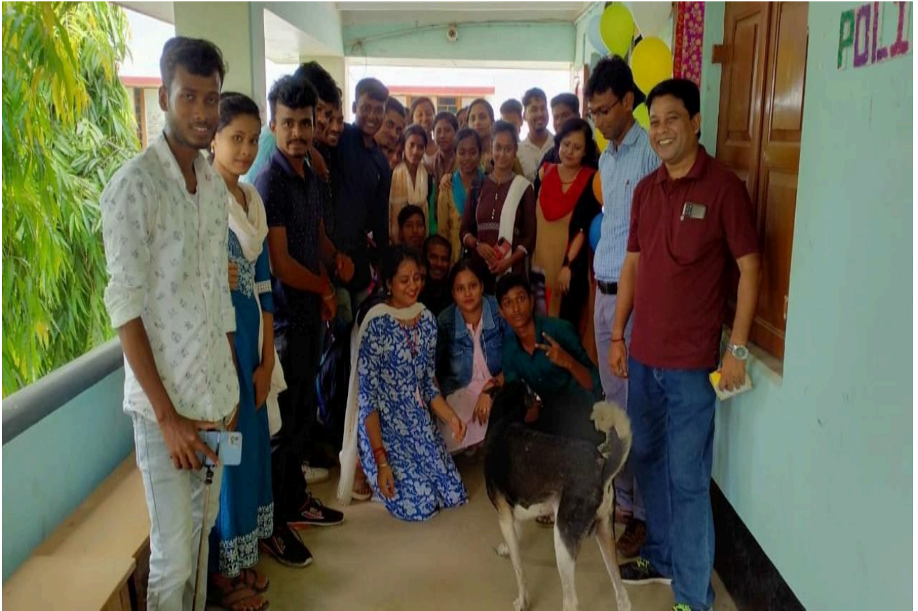
Students and faculty members in the Wall Magazine publication programme