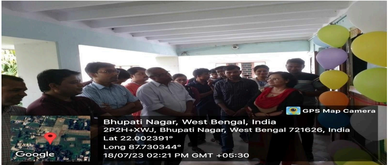
Students' participation in the Wall Magazine publishing programme.