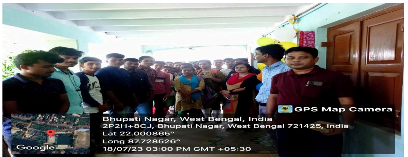
Students' participation in Wall Magazine publishing program